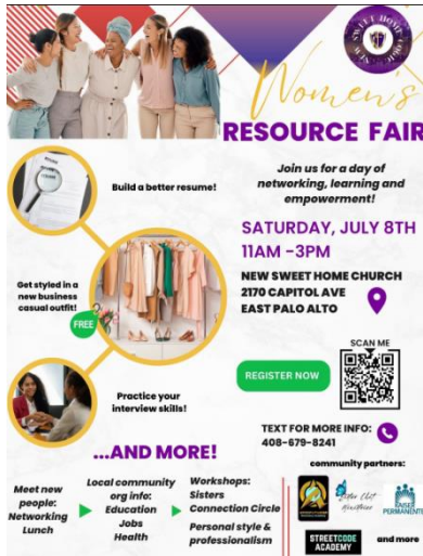
Women's Resource Fair 7/8/23 From 11:00AM-3PM