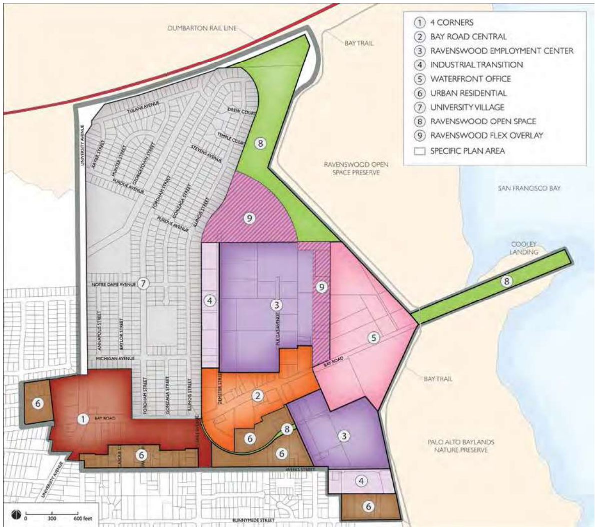
Figure 6-1: Land Use Districts

The Plan Area’s land use districts are shown in Figure 6-1 and include the following: