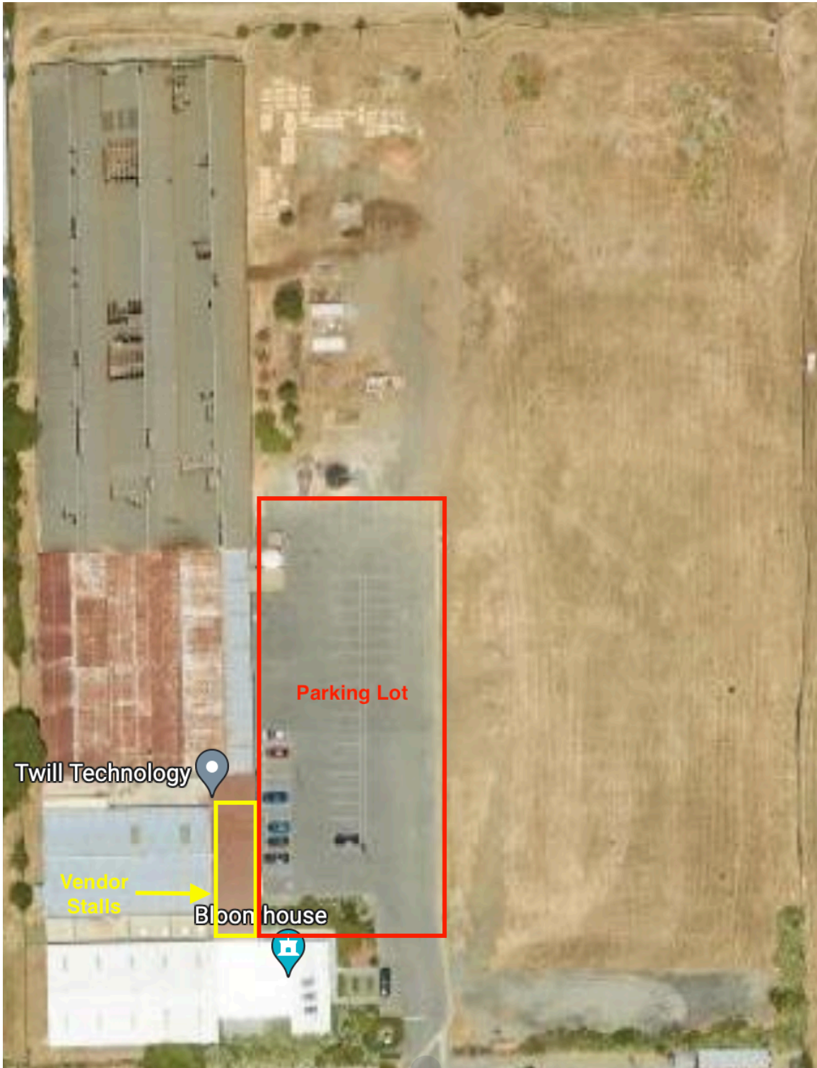
EXHIBIT E Farmers Market Site Plan