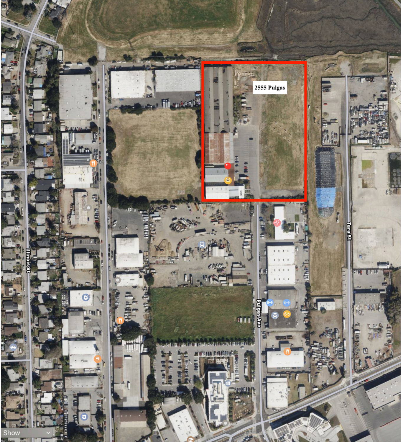
EXHIBIT A Location Map