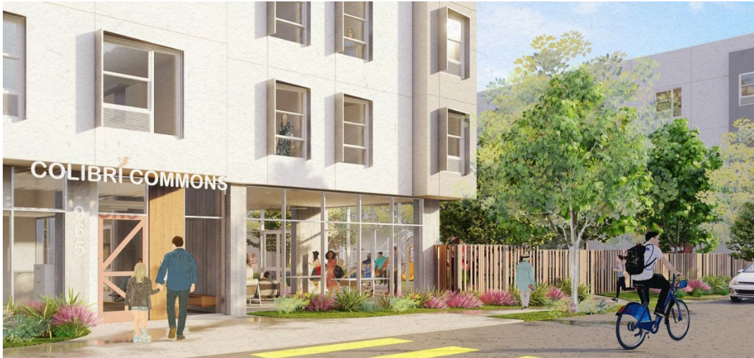
Affordable Housing Under Construction at 965 Weeks Street