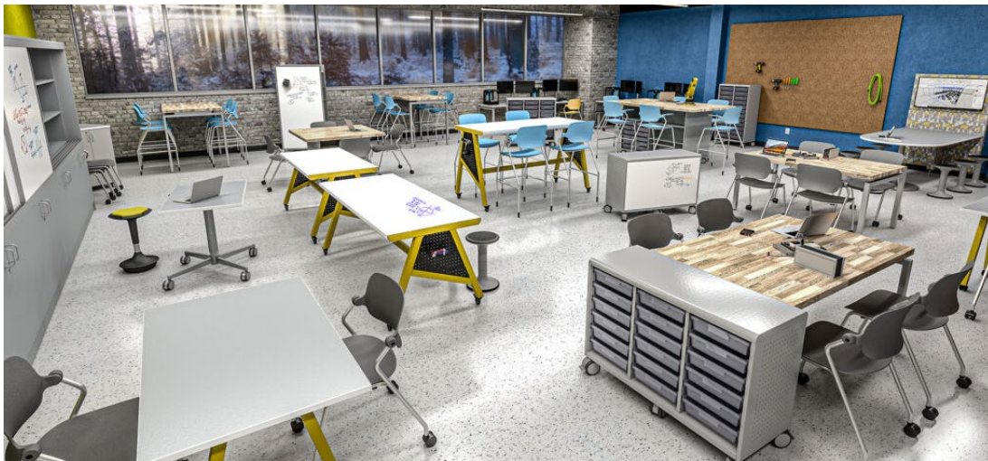
Example of a "Flex/Maker Space" to Support Workforce Development