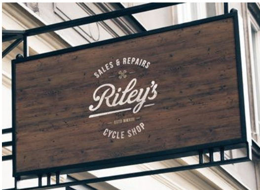
Examples of Community-Serving Retail and Public Park Improvement