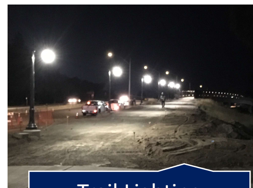
Trail Lighting Electrified