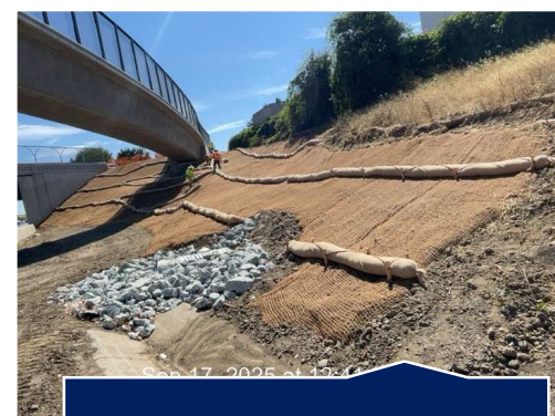
Erosion Control at Southern End of bridge