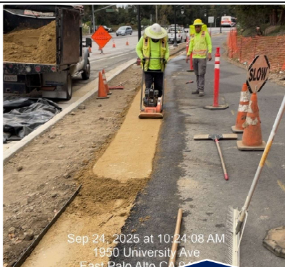
Decomposed Granite Installation South of Bridge