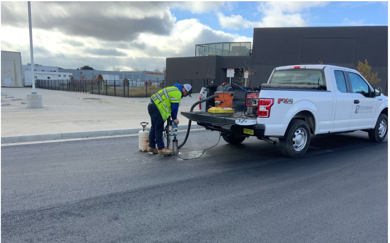
12/08/2021 – Taking core samples of the newly placed asphalt concrete