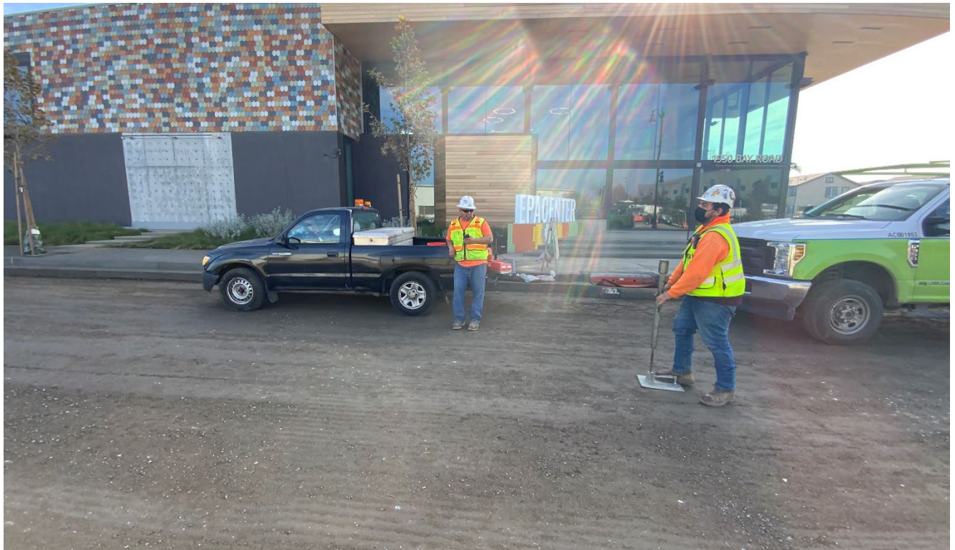
12/02/2021 – Taking compaction test for Aggregate Base on Bay Road at Pulgus Avenue