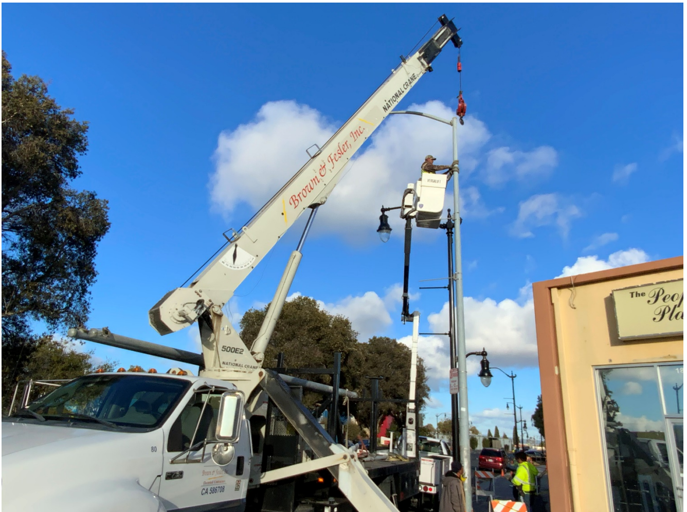
12/14/2021 – Removing one of the existing old light poles