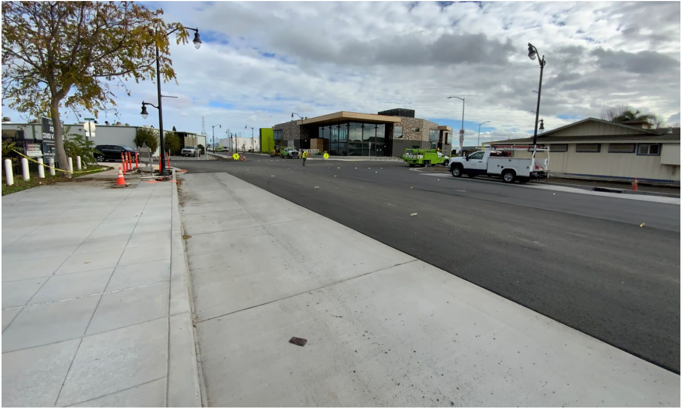
12/15/2021 – Finished pavement on Bay Road at Pulgas