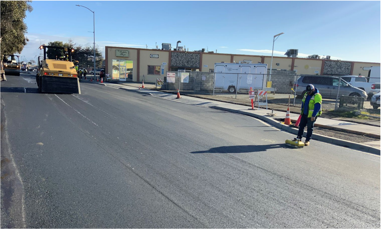
12/09/2021 – Paving the top lift on Bay Road near Demeter and taking compaction test