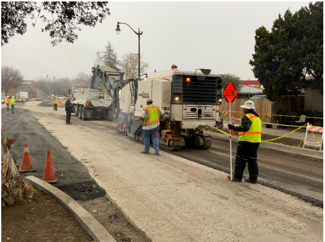
12/06/2021 – Grinding the existing Cement Treat Base (CTB) on Bay Road