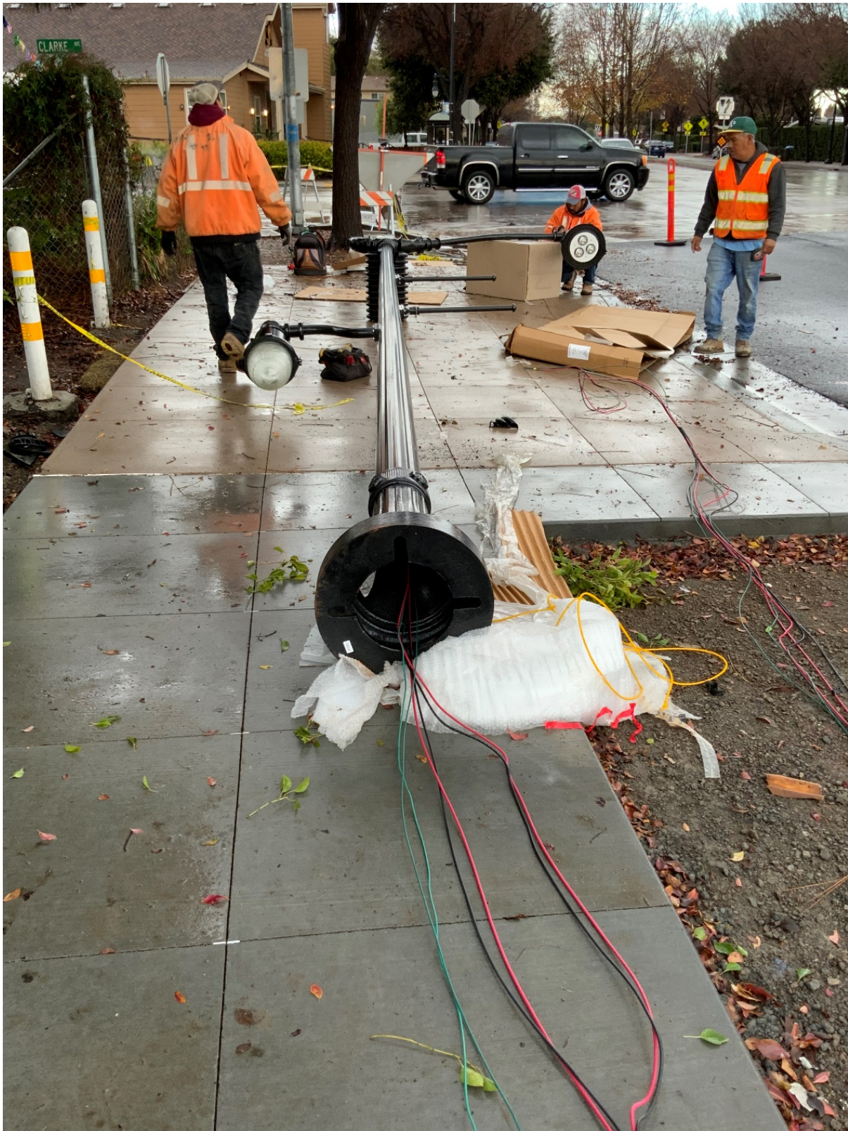
12/14/2021 – Wiring one of the new light poles before installation