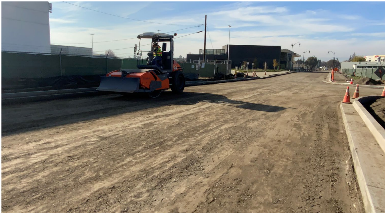
12/02/2021 – Compacting the Aggregate Base on Bay Road near Tara Road