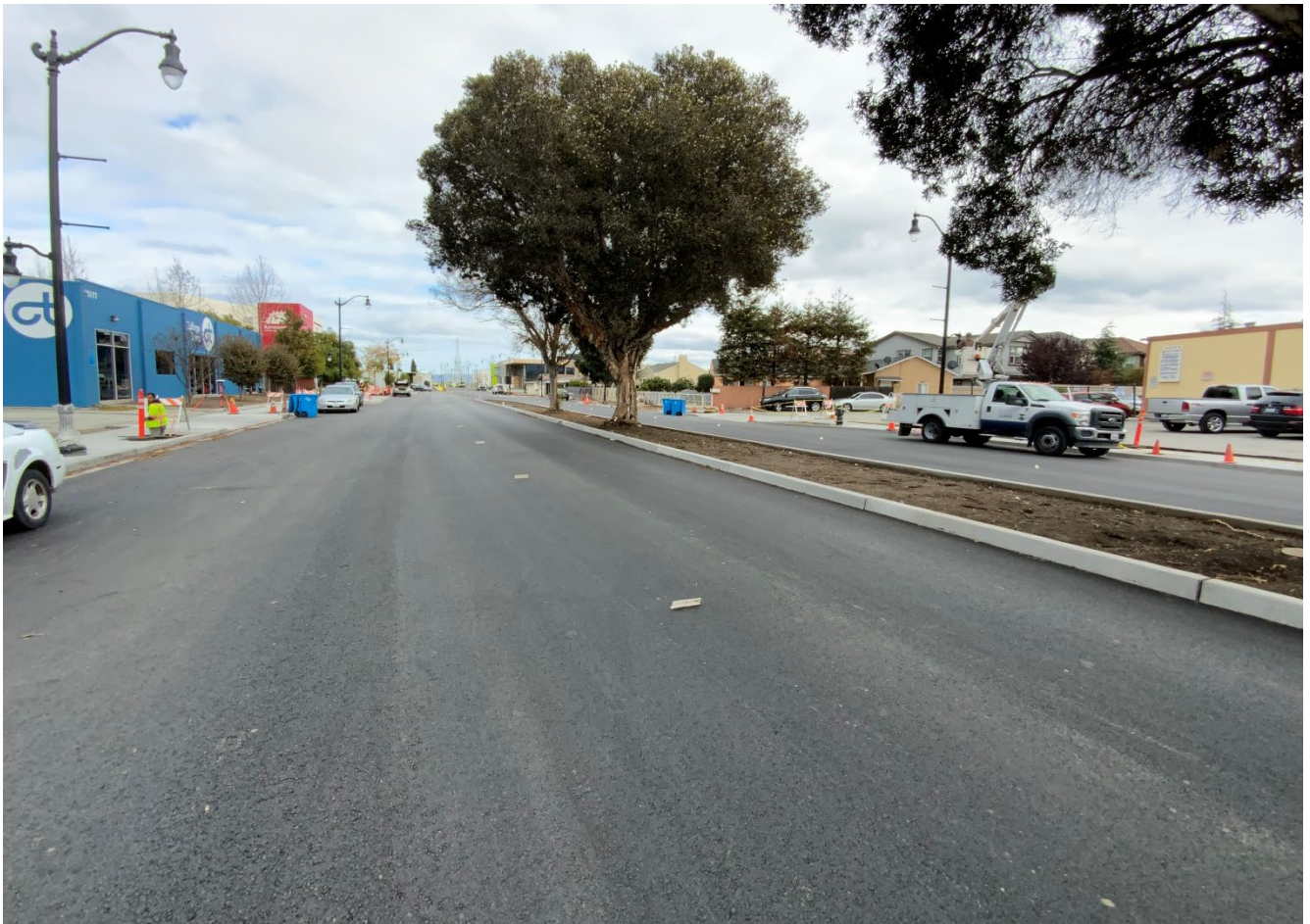
12/15/2021 – Finished pavement on Bay Road between Pulgas Avenue and Demeter Street