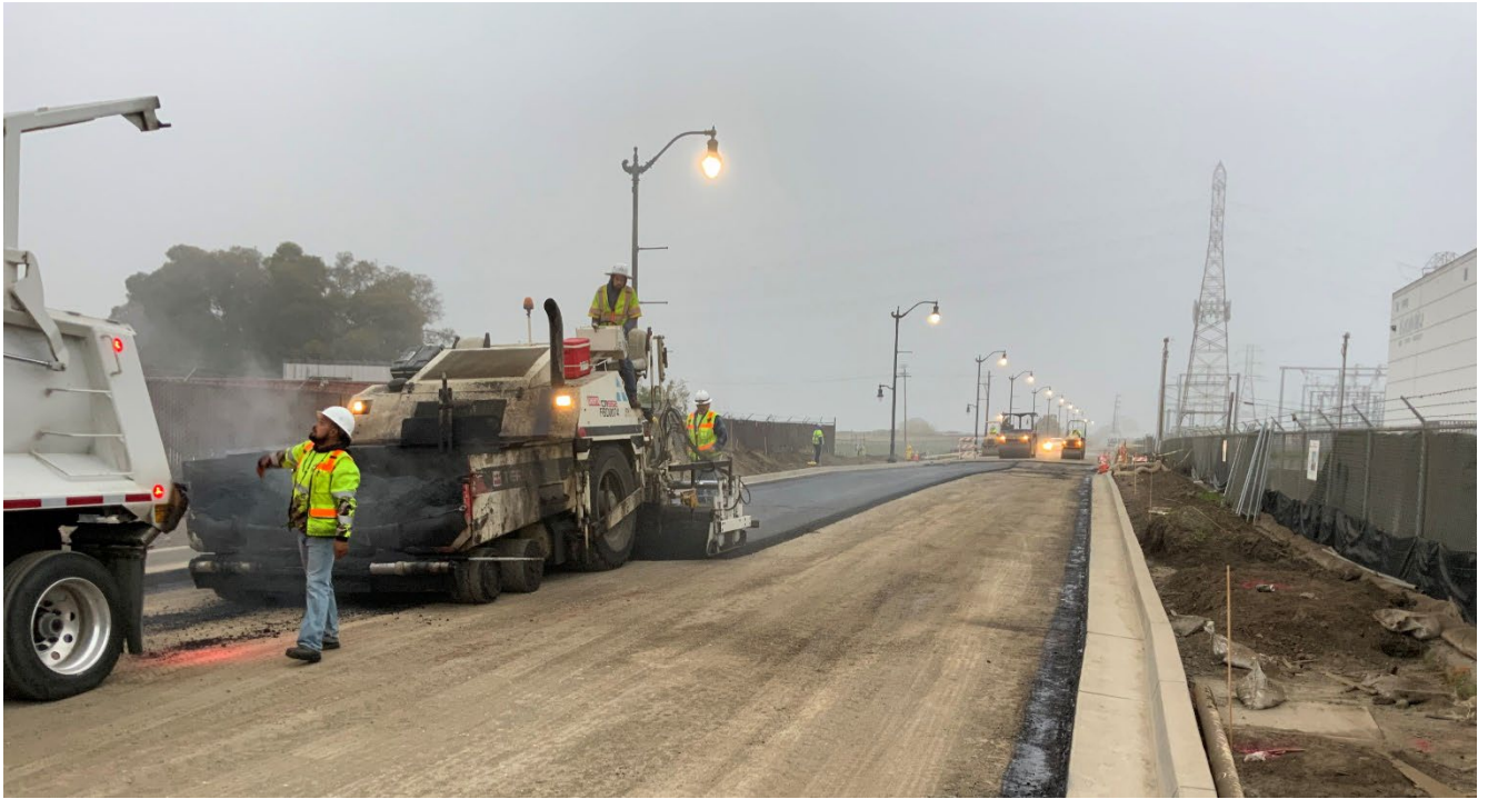
12/06/2021 – Paving on Bay Road east of Tara Road