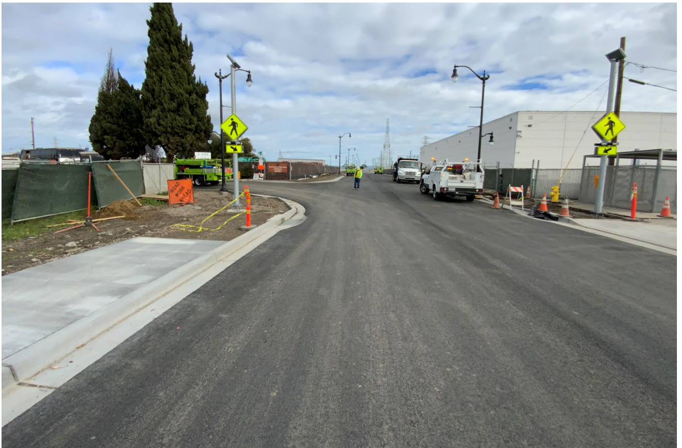
12/15/2021 – Finished pavement on Bay Road between Tara Road and Pulgas Avenue - looking east