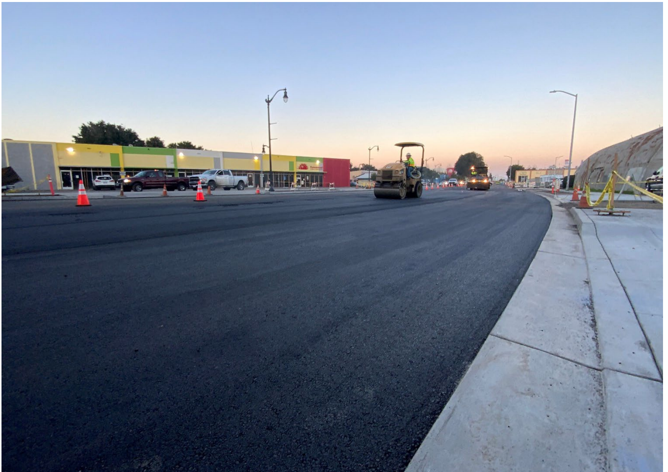
12/07/2021 – Paving on Bay Road east of Clarke Avenue