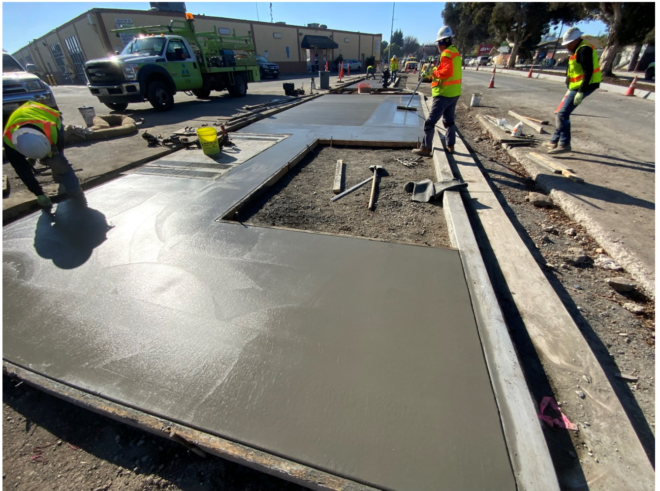
11/29/2021 – Pouring sidewalk on south side of Bay Road near Demeter Street