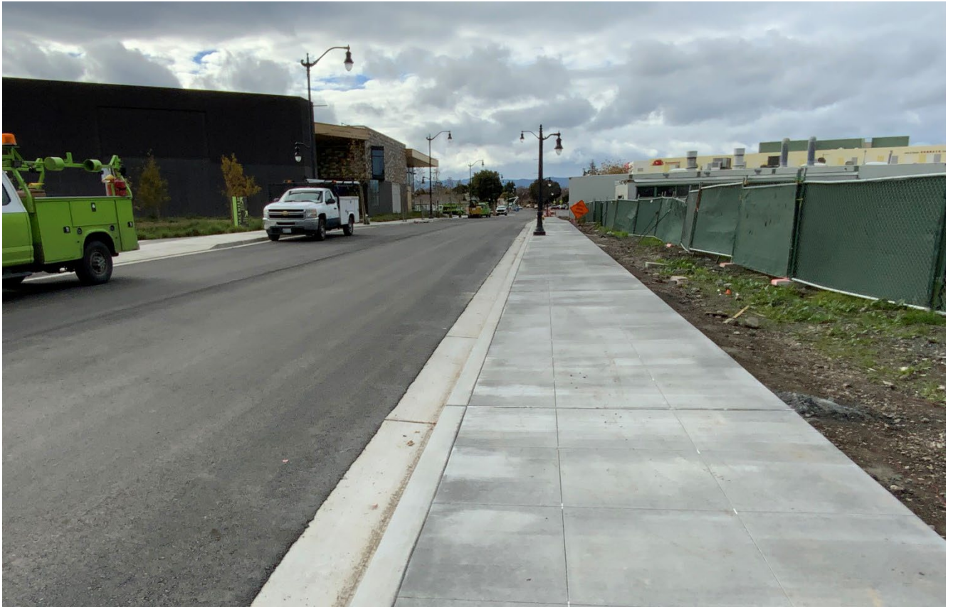
12/15/2021 – Finished pavement on Bay Road between Tara Road and Pulgas Avenue - looking west