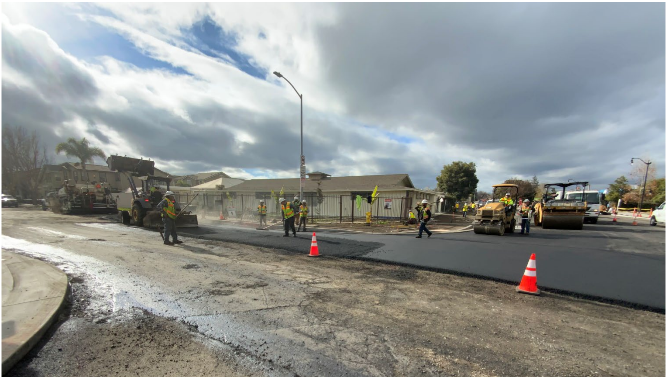
12/08/2021 - Paving at the intersection of Bay Road and Pulgas Avenue