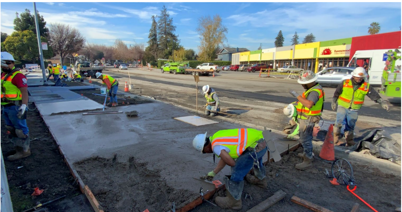
12/02/2021 – Pouring sidewalk on south side of the Bay Road at Demeter Street

Below are few pictures, representative of the field operations during this period: