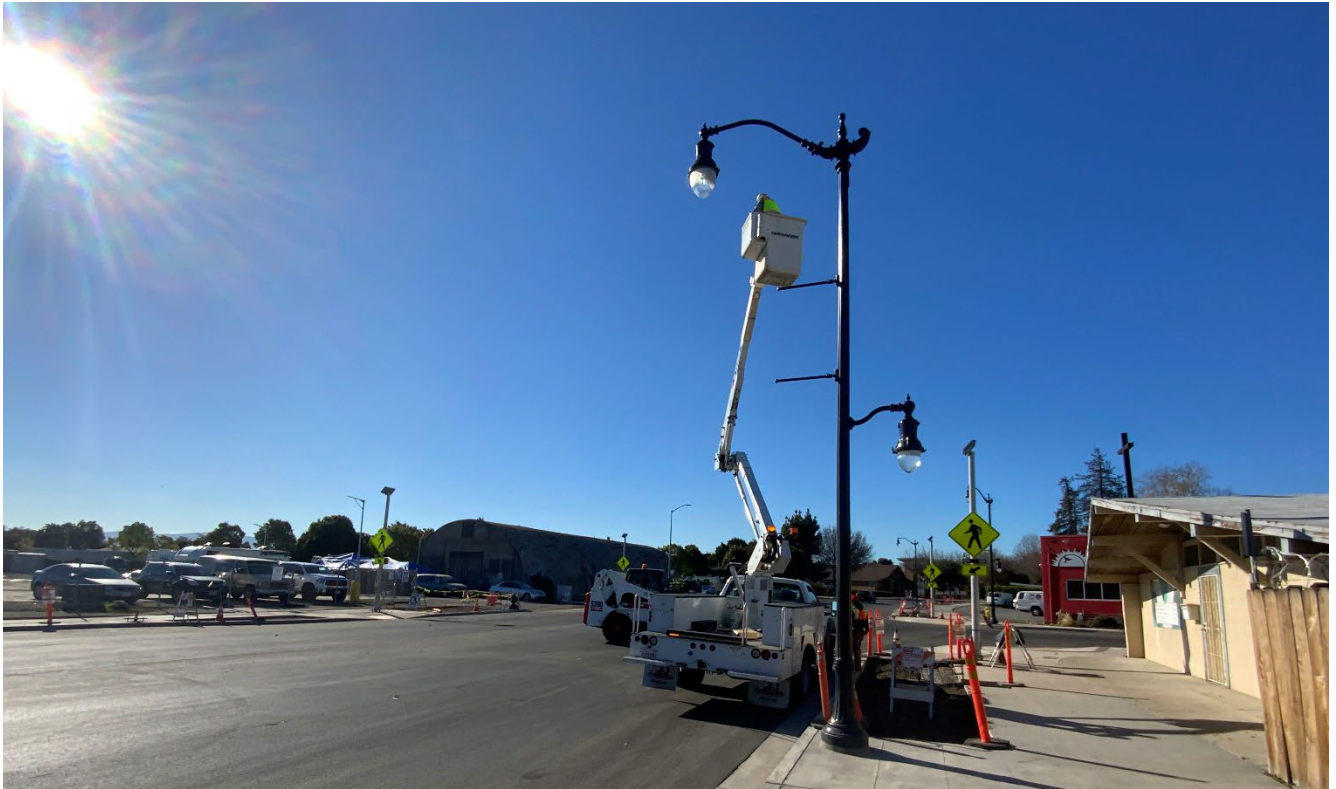
12/10/2021 – Installing a new decorative light pole