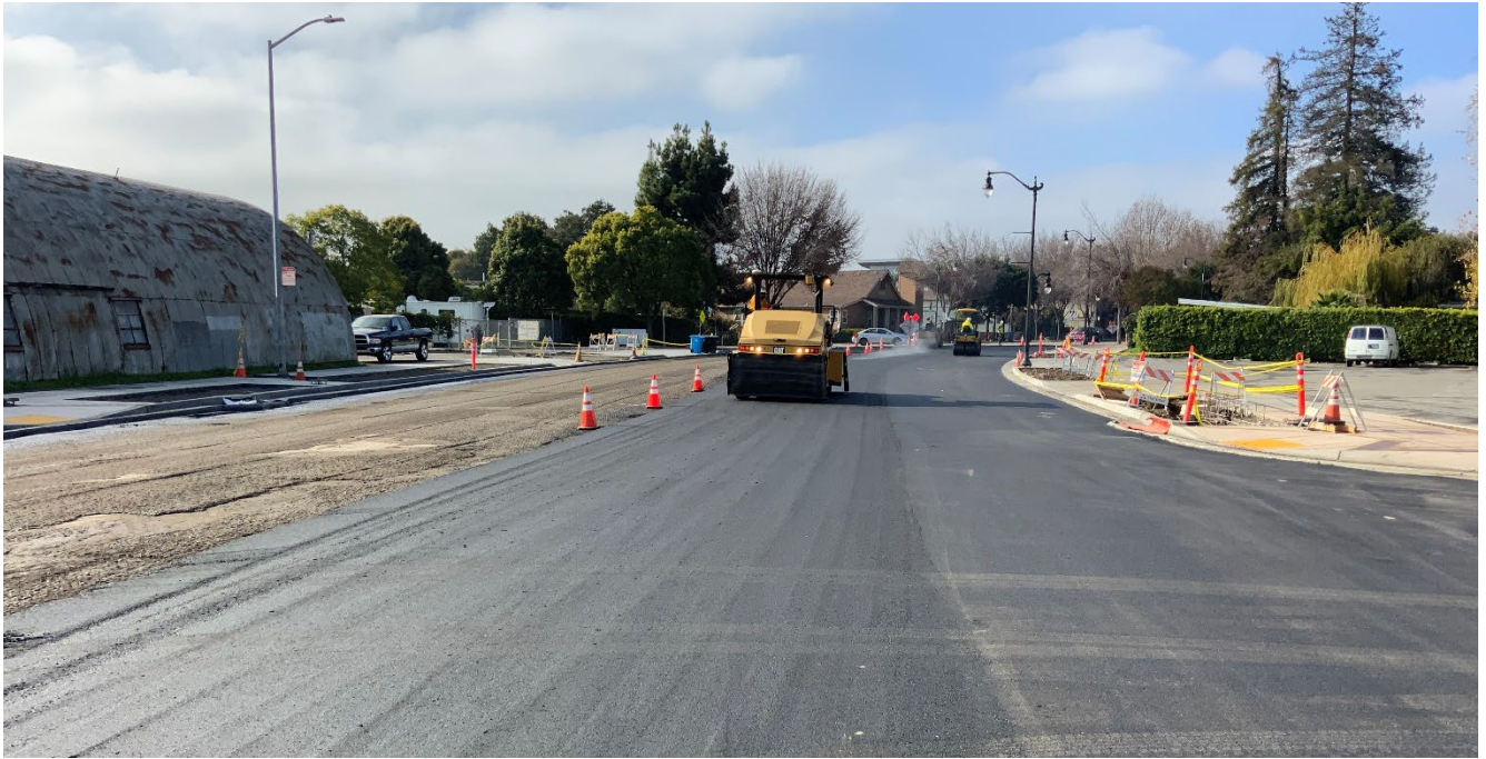
12/07/2021 – Paving on Bay Road at Demeter Street